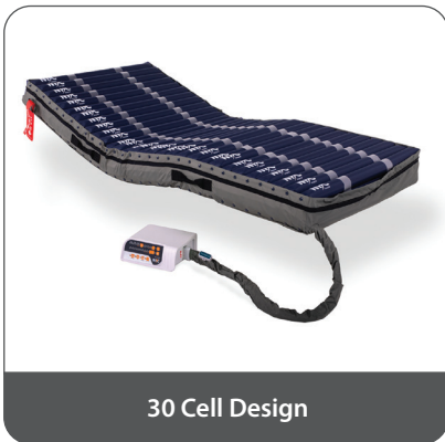
30 Cell Design