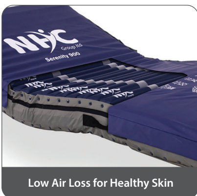
Low Air Loss for Healthy Skin